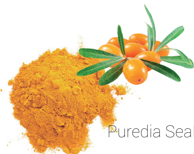
Puredia SeaBerry™ fruit Omega Powder OP 2.0

Puredia SeaBerry™ is a very safe product thanks to its purity and organic origin, as well as its nutritional composition.